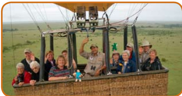
Alums take a hot air balloon ride over the Serengeti.

We hope you take advantage of the travel opportunities that are advertised below or one of our future alumni-sponsored trips. You'll enjoy sharing the experience with others who have an affinity for Marygrove.